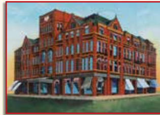
#2 Historical Ellis Avenue Mural

The Asaph Whittlesey Mural depicts the Ashland National Bank as it appeared in 1892. The bank was located on the Main Street end of the building where the mural is painted.