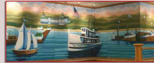
#11 Bay front Mural 6th Avenue West & Main Street • 2004

Honoring the Women of Ashland. There are 32 portraits.