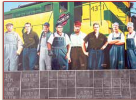
#5 Railroad Mural 306 West 3rd Street • 2013-2014

When built in 1916, Ashland's 1,800 foot Oredock was the largest concrete dock in the world. The top portion of the mural is "to scale" painting of the Oredock itself, including every properly numbered ore chute. The lower section includes 21 "postcards" telling the history of the varied uses of the structure over the years.