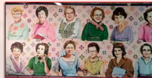
#10 Women of Ashland Mural Vaughn Avenue & Main Street • 2018

This mural is in honor of all the Ashland Area Military Men and Women who served our nation in various wars and conflicts. Their sacrifices will never be forgotten. We proudly salute them all.