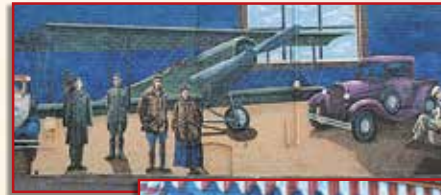
#6 Aviation, 1920's Jazz Era, & Schiller Shoe Store Mural

Located near the historic Soo Line Depot building, this mural represents both the Soo Line and Chicago and Northwestern rail lines that served Ashland. As with most towns, the railroad was Ashland's life blood that made a great deal of its commercial growth possible. All of the men are actual railroad workers.