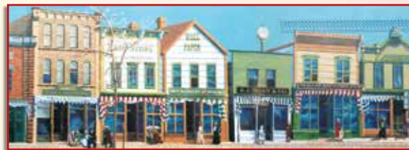
#7 Storefront Mural 4th Avenue West & Main Street • 2003

This mural celebrates Ashland's early aviation history, its jazz past, as well as the Schiller's Shoe Store which was located in the store it is painted on.