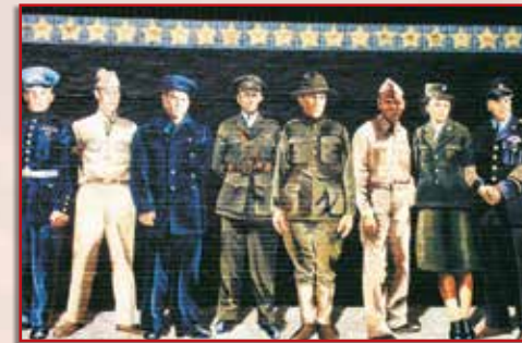
#9 Veterans Mural Vaughn Avenue & Main Street • 2005

The Lumberjack Mural depicts the men (and one rare woman) of Ashland's lumber era, when the work day was from 4 a.m. until dark, first freeze to first thaw. An average day's work for a pair of "sawyers" was 100 pine logs, at $1.00 a day. In 1893, 10,000 lumberjacks worked in the logging camps to supply Ashland's ten sawmills.