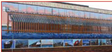
#4 Ashland Oredock Mural 301 West Main Street • 2010

The owner of the building wanted to honor the woman who raised him and had recently passed away. This photograph was taken in front of the building the mural was painted on in the 1940's.