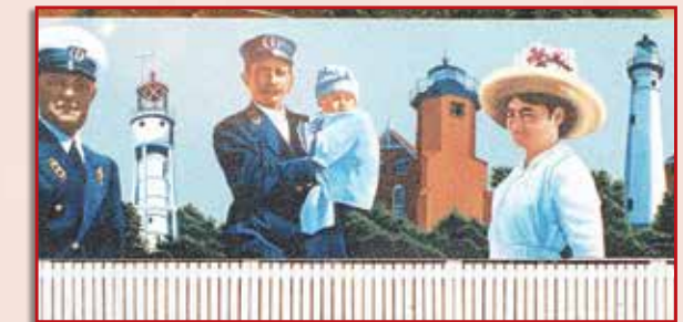
#13 Lighthouse Mural Corner of Chapple Avenue & Main Street • 2000

If you were raised in the 50's, head down to the east facing wall outside of 612 West Main Street. Here you can step back in time as you take a look at the 1950's Snapshot Mural.