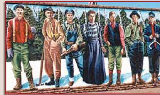
#8 Lumberjack Mural 4th Avenue West & Main Street • 2000

A compilation of various Ashland storefronts from the early 1900's. The artist featured a variety of architecture found in the Ashland area.