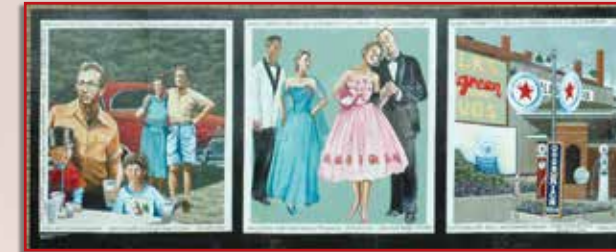
#12 1950's Snapshots Mural 612 West Main Street • 2007

The Bayfront Mural represents industry along the Ashland shoreline in the 19th century.