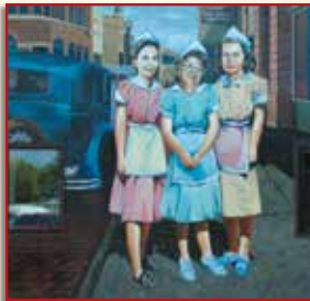
#3 Waitress Mural 124 West Main St • 2007

Painted on the former Lake Superior District Power Company building. This mural features Northland College's Wheeler Hall, The Knight Hotel and the old Ashland High School.