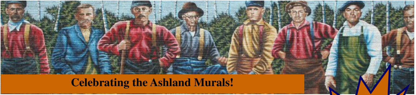
Celebrating the Ashland Murals!